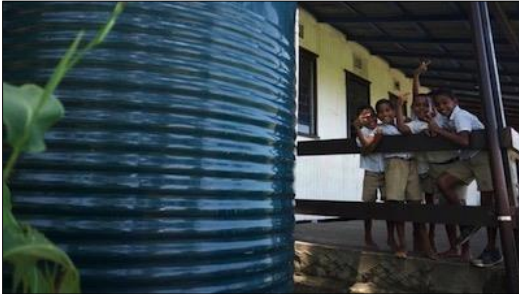
Figure: The Fiji WASH Cluster has been instrumental in coordinating water and sanitation recovery efforts in the aftermath of 2016's Tropical Cyclone Winston (SPC)